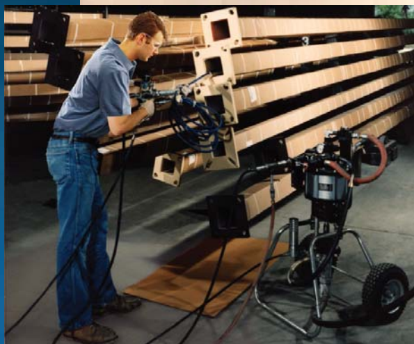
▲ DuraGrip Coating is being applied

Poles finished with LSI Lighting Solutions Plus' DuraGrip and DuraGrip Plus with inner-coating of a water-based automotive-grade corrosion preventative far outlast other pole finishes as proven here by this salt spray water test. The DuraGrip and DuraGrip Plus poles retain their finishes while the other pole finishes show evidence of severe peeling, oxidation, and rusting.