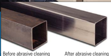
Before abrasive cleaning