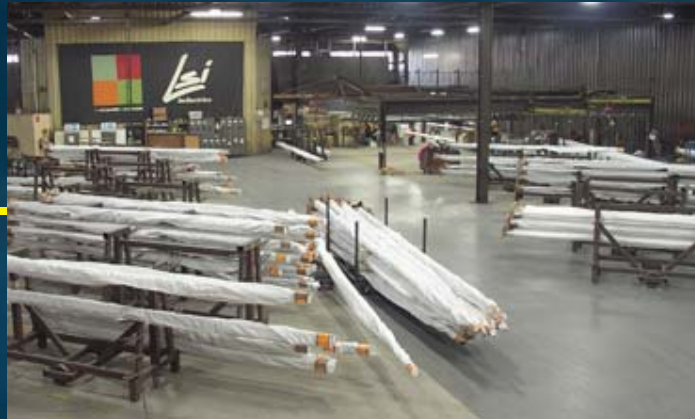
▲ LSI Pole Inventory Area - Poles finished and ready to ship

DuraGrip Plus is our top-of-the-line pole finish. In addition to our standard DuraGrip exterior polyester-powder coated finish, an inner-coating of a water-based automotive-grade corrosion preventative is applied. This coating seals the bottom portion of the pole to protect against moisture and atmospheric corrosive matter. DuraGrip Plus is warranted for seven years.